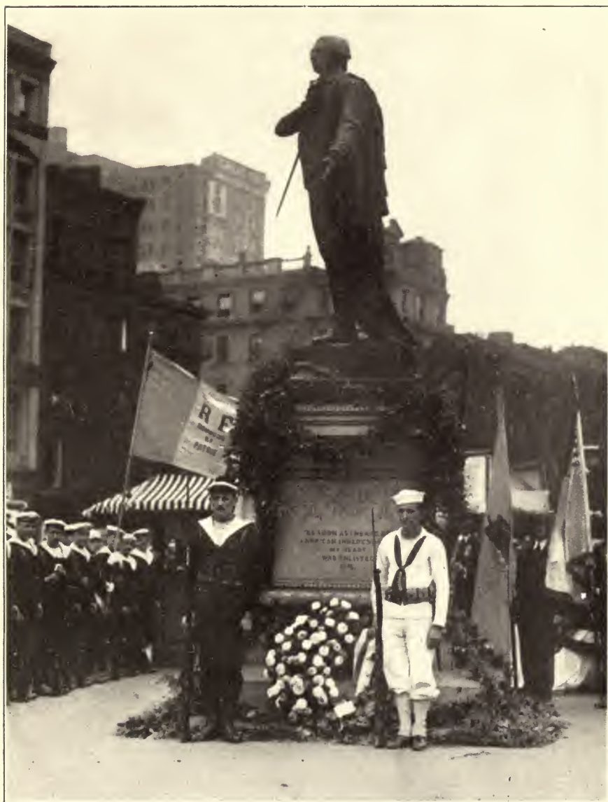
The Lafayette Monument, Union Square, N. Y., on Lafayette Day, Sept. 6, 1918.